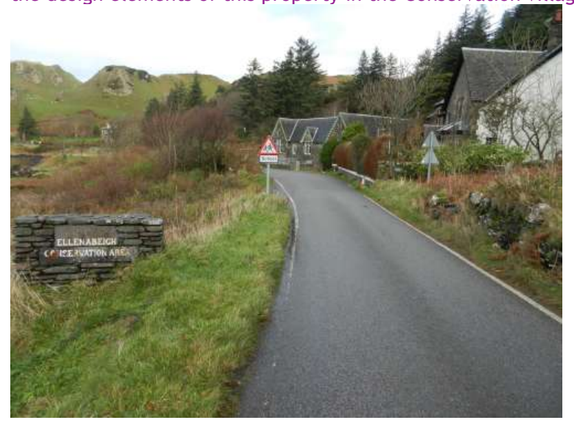
Here is the same house from a different angle the dry stone wall which is closer is to a field and therefore old agricultural.

Mr Hill's photograph of the start of the conservation area shows clearly a stone house with white rendered gables fronted by a stone wall with white painted top, drawing together the design elements of this property in the Conservation village