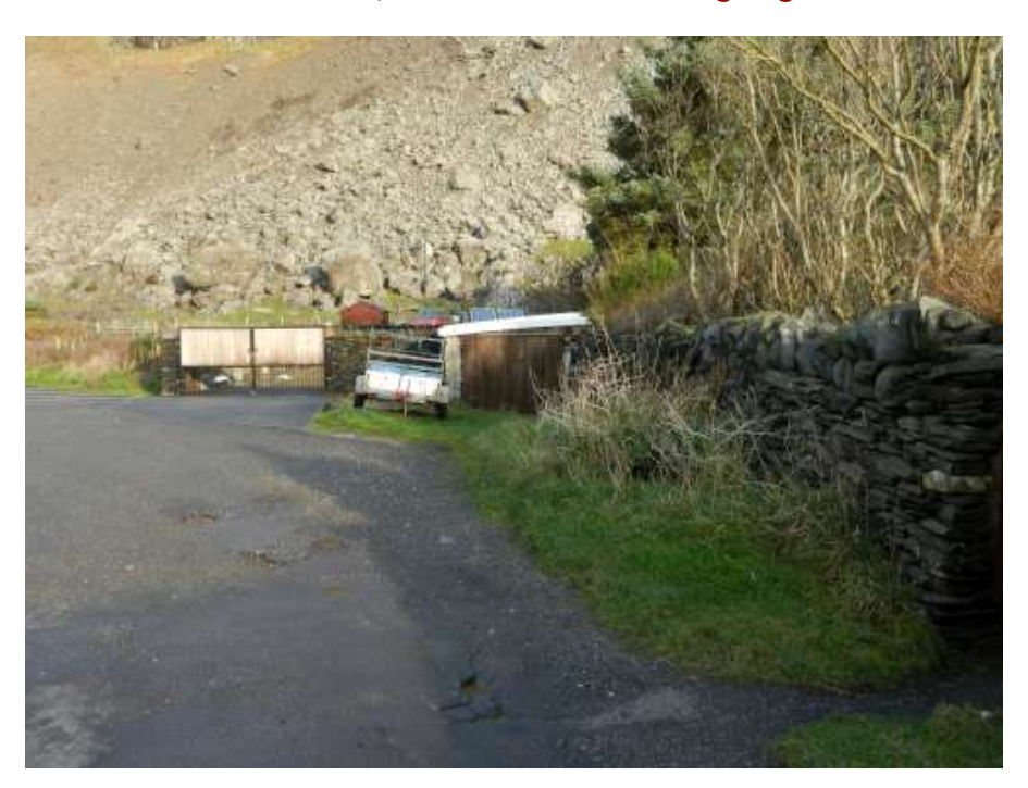
See below, the white wall which Mr Hill has selectively precluded from his photograph

(a wall which is, by necessity of the petrol storage site, engineered and then clad with stone as a compromise attempt to blend in with the existing, natural stone wall again which the site has been built you will see that the garage, as mentioned in Mr Hill's report as a stone garage, has indeed been rendered; albeit somewhat degraded, - it is a different colour and has a tin roof, It is a white rendered garage that we need too)